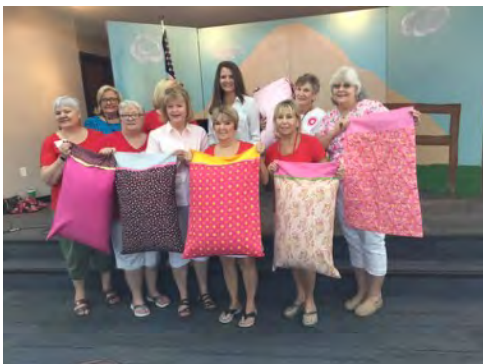
“Busy Bees” and finished pillowcases for Anchorage Home and Sims Veterans Home.