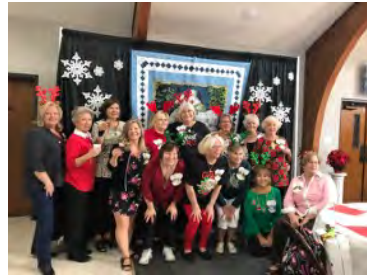
GREAT JOB EVENTS COMMITTEE