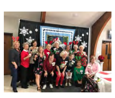
GREAT JOB EVENTS COMMITTEE