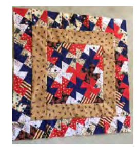
JO-ELLEN ROGERS LATEST PROJECT