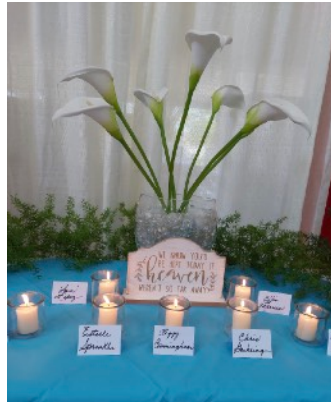
MEMBERS LOST OVER THE PAST YEAR REMEMBERED