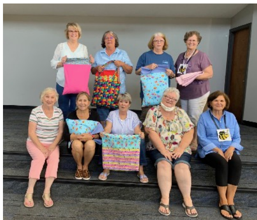
BUSY BEES LATEST PROJECT PILLOWS AND TOTES FOR "FOSTER CLOSET"