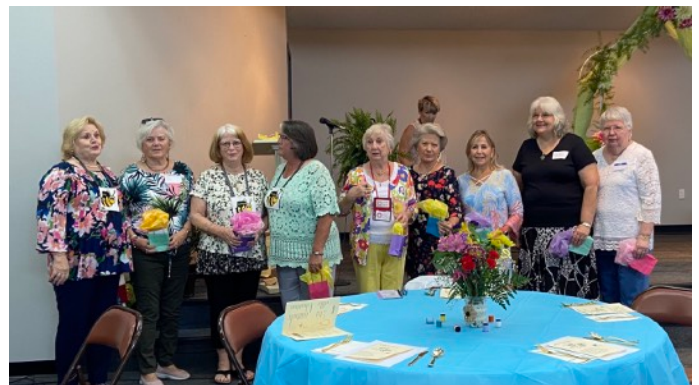
EVENTS COMMITTEE - GREAT JOB!