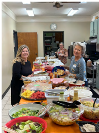
Thanksgiving Pot Luck