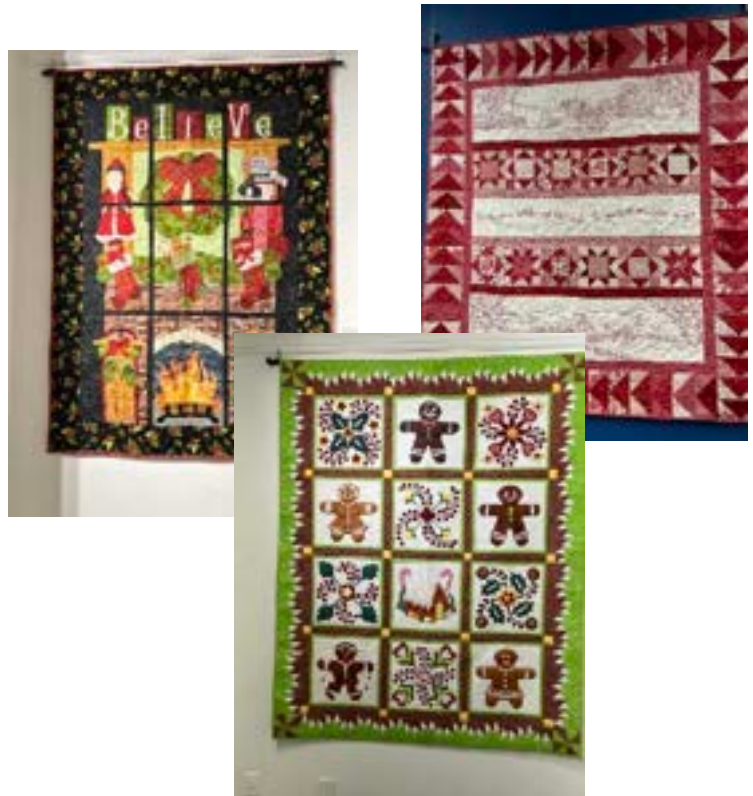
Christmas quilts displayed at the Arts Center